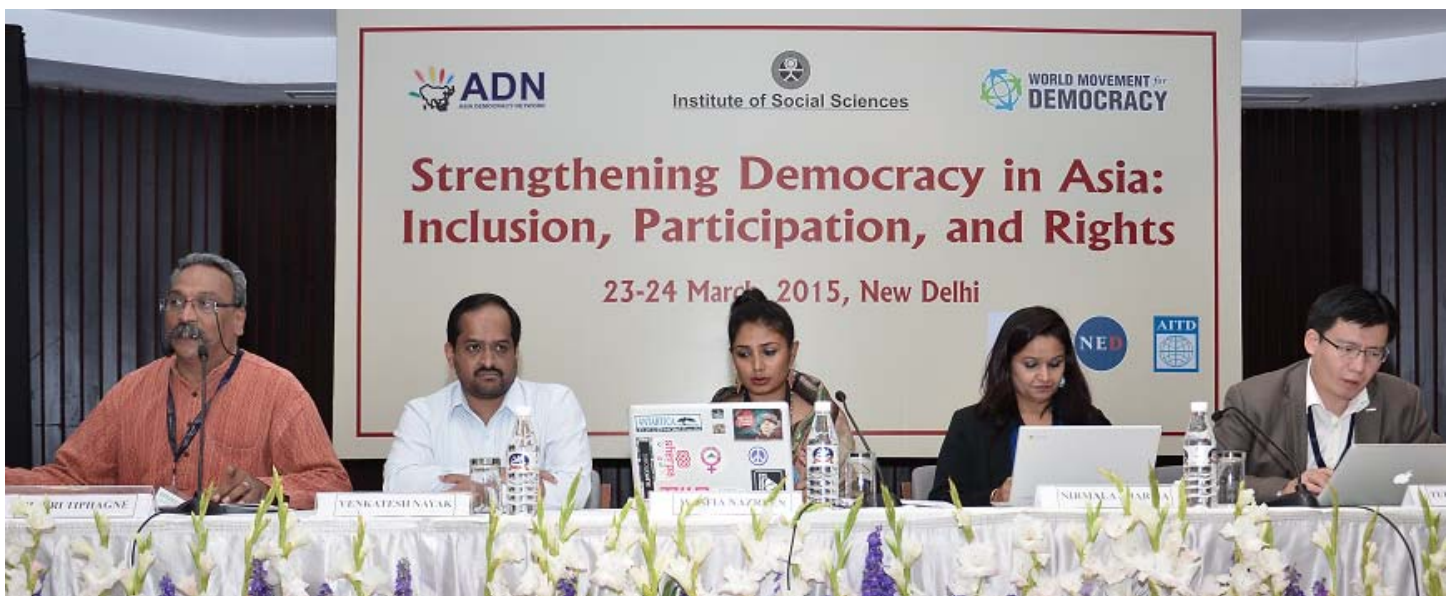
The Session on “Right to Information and Freedom of Expression”.

The third session of the day and the final session of the conference was on “Right to Information and Freedom of Expression” organized by the Asia Democracy Network and moderated by Henri Tiphange, Chairperson, Forum-Asia. The session discussed in depth the importance of having the right to information and freedom of expression as the backbones of any democratic society. Right to information is essential to enable people to protect their human rights. In most countries in Asia for