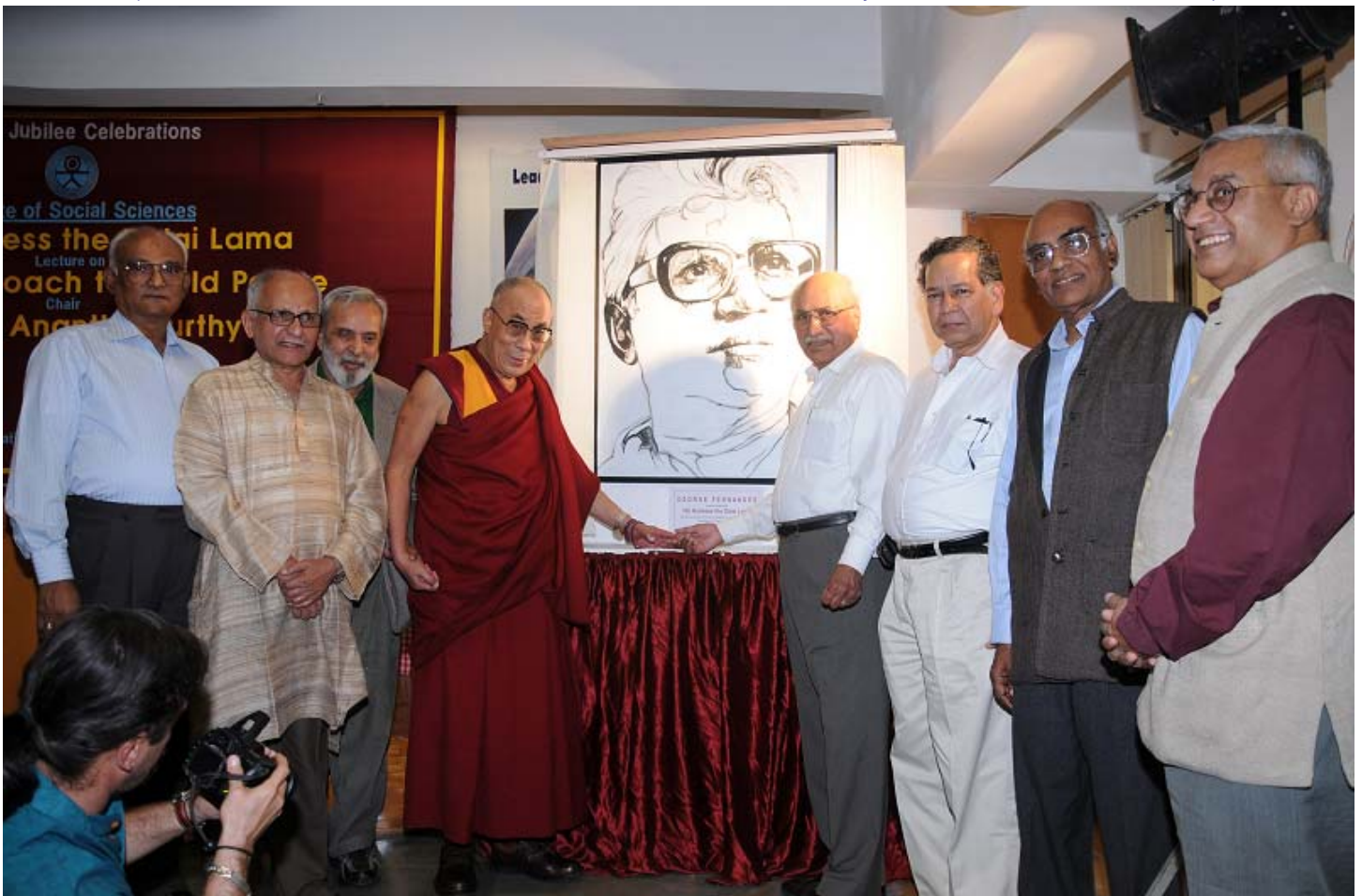
His Holiness the Dalai Lama unveiling the portrait of former Defence Minister George Fernandes at the Institute of Social Sciences on 19 November 2010