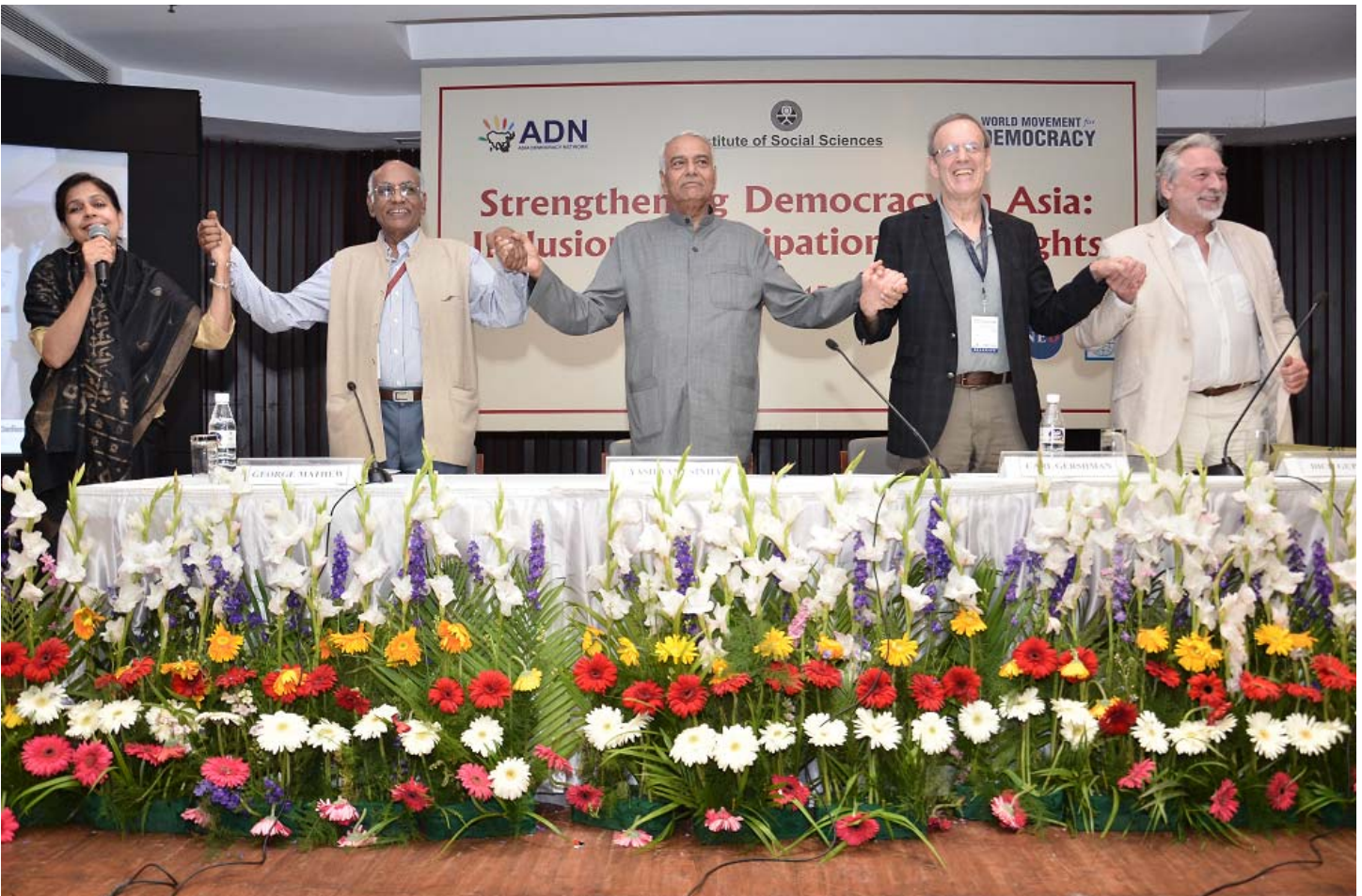
In Solidarity....Let us strengthen democracy

The two day programme ended with a farewell dinner hosted by Institute of Social Sciences at the Fountain lawns of the India International Centre. ■