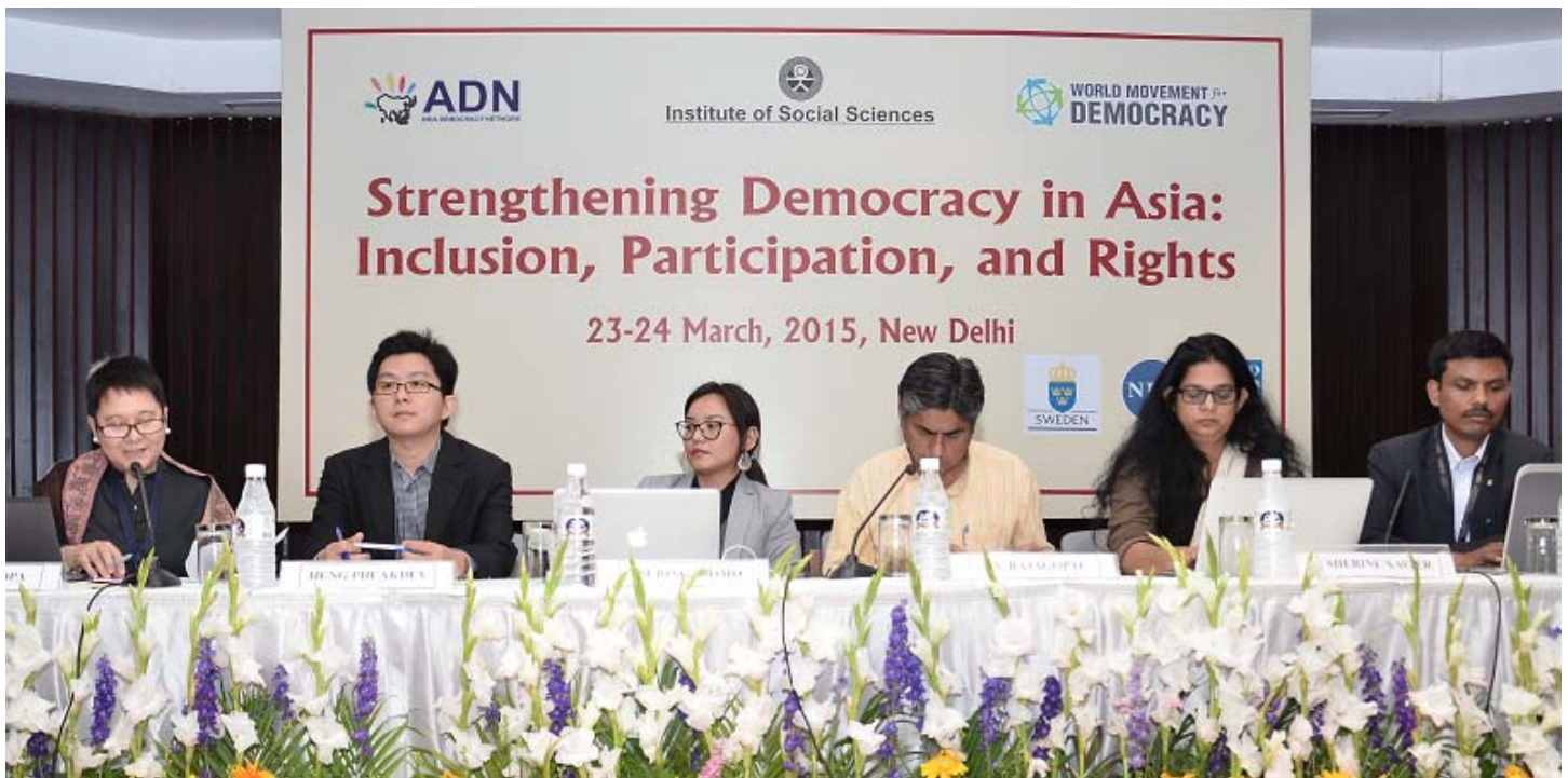
The Session on “Resource Extraction, Land Disputes and Marginalized Communities”.