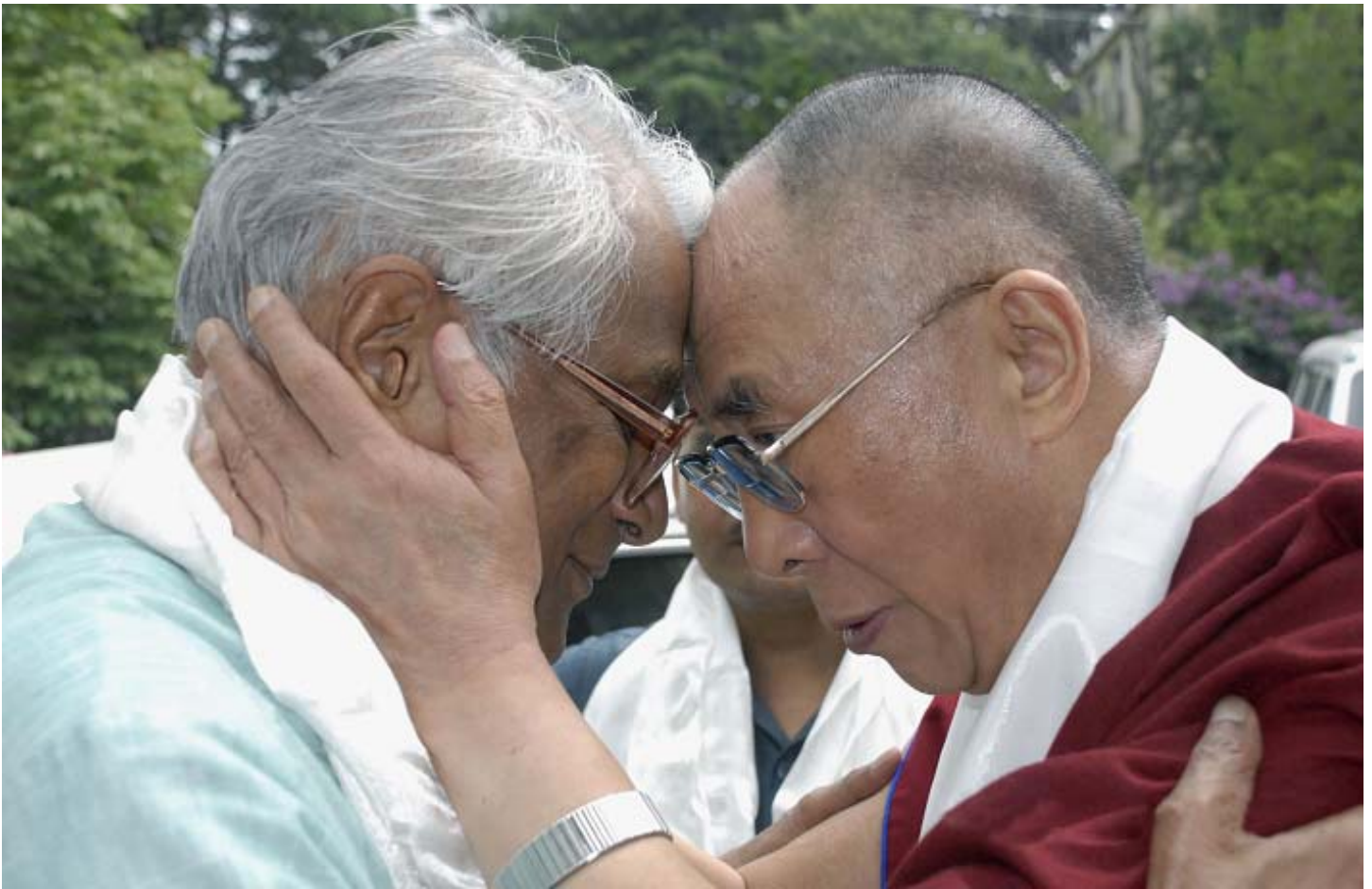
His Holiness the Dalai Lama with Mr. George Fernandes at Dharmasala in August 2009